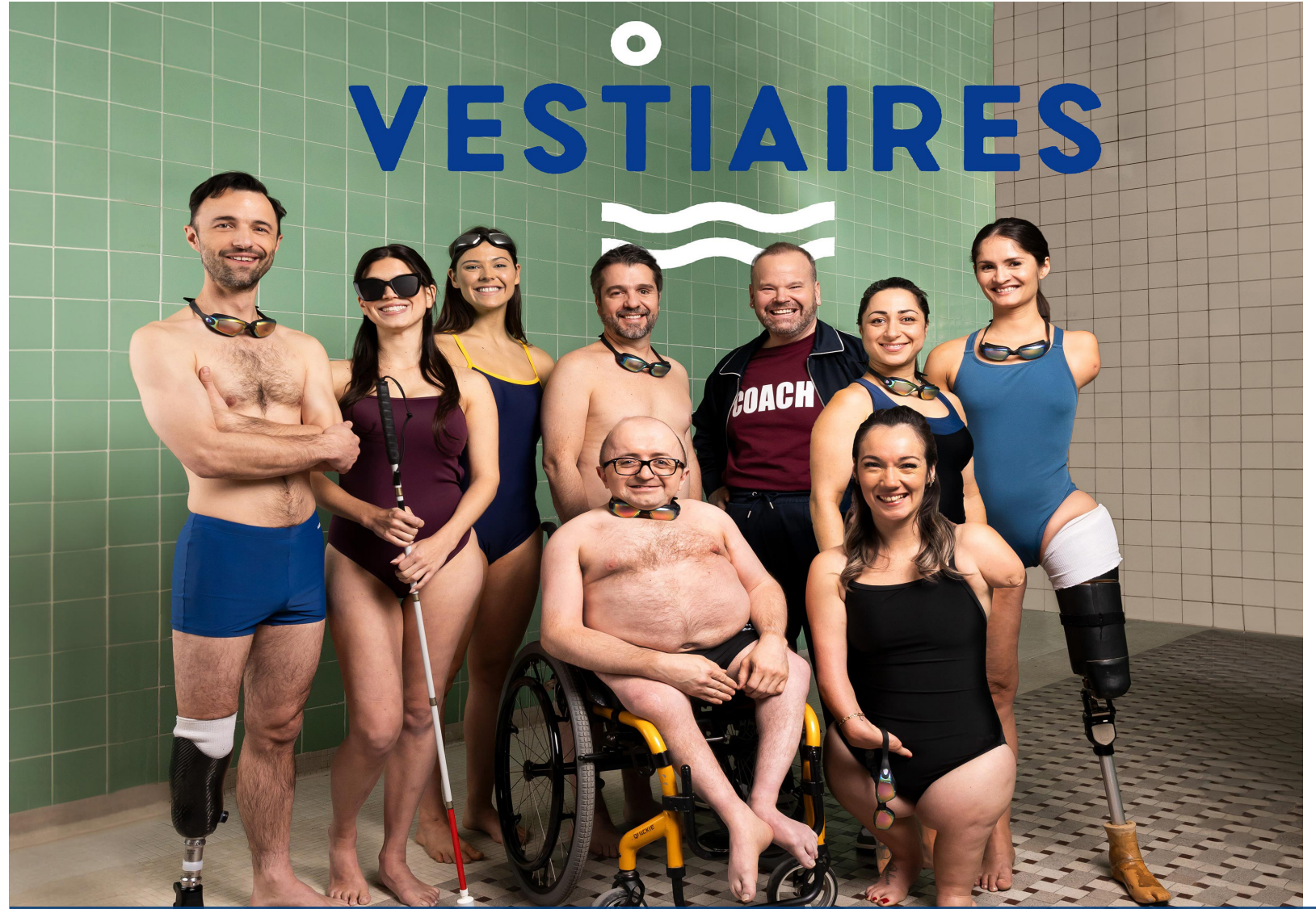
The cast of Vestiaires

AMI-télé has continued its commitment to producing original programming that is both interesting and pertinent to the francophone community and Canadians of all abilities. Original programs include Ça ne se demande pas , Pas de panique, on cuisine! , Style sur mesure and the very popular recent hit comedy Vestiaires , AMI's first-ever scripted series.